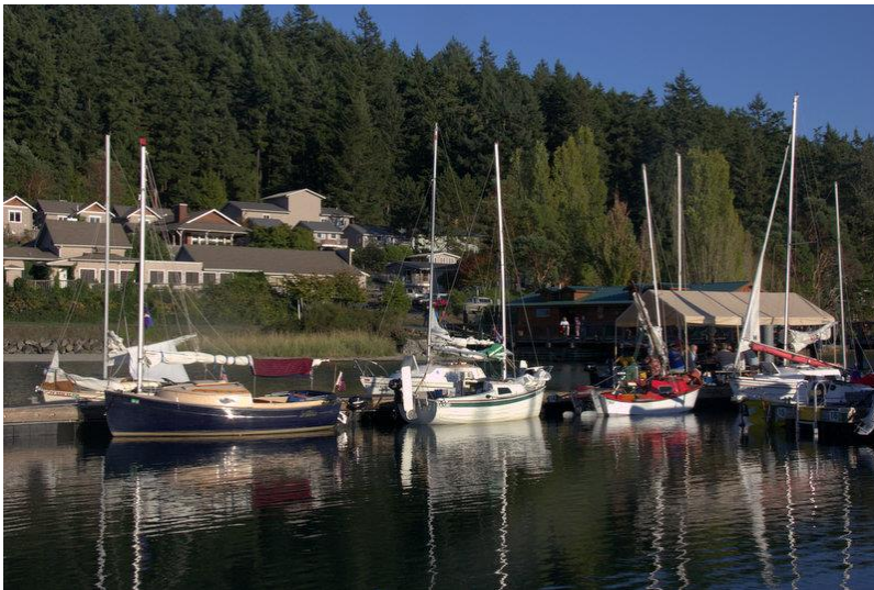
Another beautiful day in the San Juan Islands