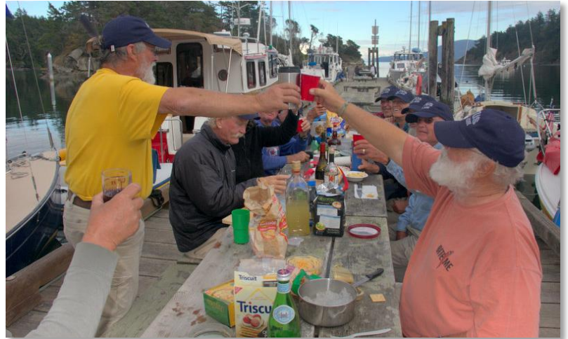
Toasting another successful day of sailing

Next morning, Friday, we readied for the shorter trip to Deer Harbor (8-9 miles), but the channel was looking ominous with whitecaps, so everyone reefed. I had only my racing main along (whoops), so I jury-rigged a reef in it and set off. It's hard to describe, but the energy of the mixing currents and the strong, shifty winds made it feel like sailing inside a washing machine. Not dangerous, but hard to find a