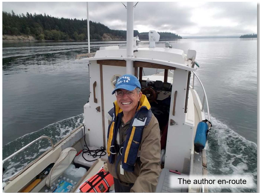
The author en-route

The next day we continued north to Kingston and rendezvoused with the remainder of the Messabout