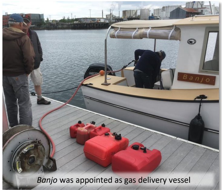
Banjo was appointed as gas delivery vessel