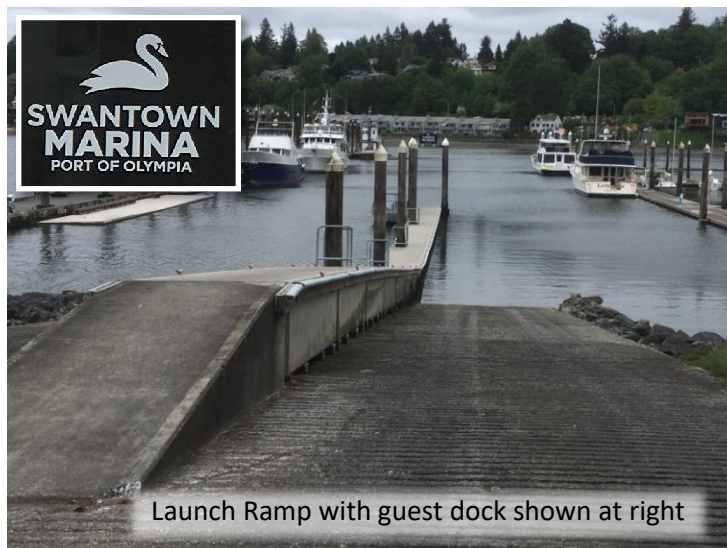
Launch Ramp with guest dock shown at right