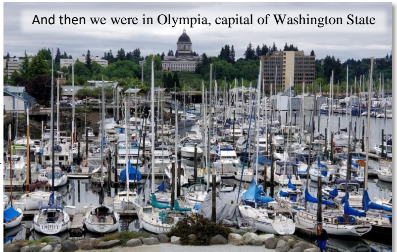
And then we were in Olympia, capital of Washington State

Wednesday was a leisurely day starting with breakfast at Budd Bay Café , about 8-11 AM, followed by some sightseeing around Olympia and a purchase of macarons & cupcakes from Mystical Cupcakes . A few took a ride on Banjo , and then for some it was dinner at Budd Bay Café again while others ate at Dan's choice: The Oyster House .