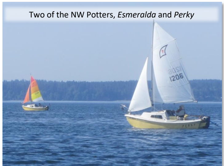
Two of the NW Potters, Esmeralda and Perky