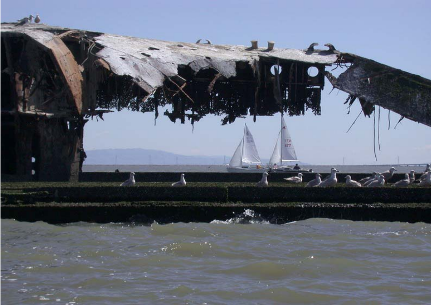
Looking through the Thompson