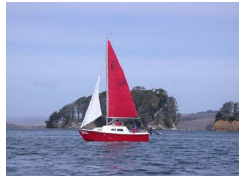
Dave White sailing past Hog Island at the Tomales Bay sail on September 18th.

Most of the day was spent reefed and sailing in 15-20 knot winds. I sailed by Pat Brennan and he commented that of course I showed up for the good weather (if only we knew what was coming in the next 18 hours). By late afternoon we had toured a lot of the bay and we reached over to the campsite beach and unloaded copious amounts of food, gear, and our shared feast of 36 fresh large oysters from Tomales Bay Oyster Co. just south of Marshall. As the boats began to come in for the day, the firewood piled up we saw a few majestic deer that were either going to Iraq or had a nice rack depending on who you listened to. Eric treated us to a BOB (bowl overboard) show. How fast and how far can a bowl sail at Tomales? You'd be surprised but Eric's recovery skill made us all proud as he brought everything back to the shore, even his now wet hat.