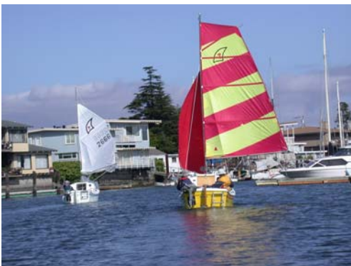
Cruising San Rafael in August