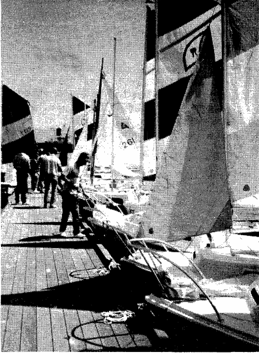
WP National Regatta, Encinal YC, Alameda