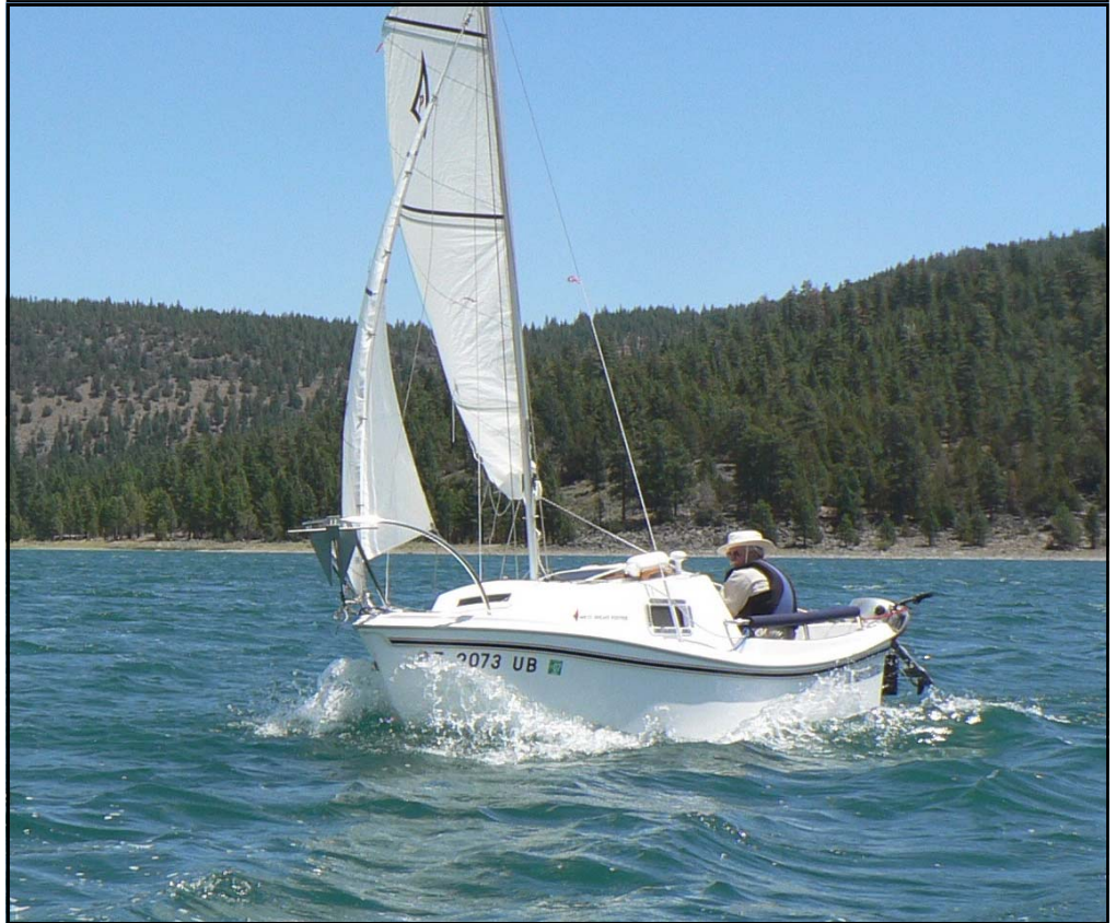
Ron Bell and Least Tern at Eagle Lake