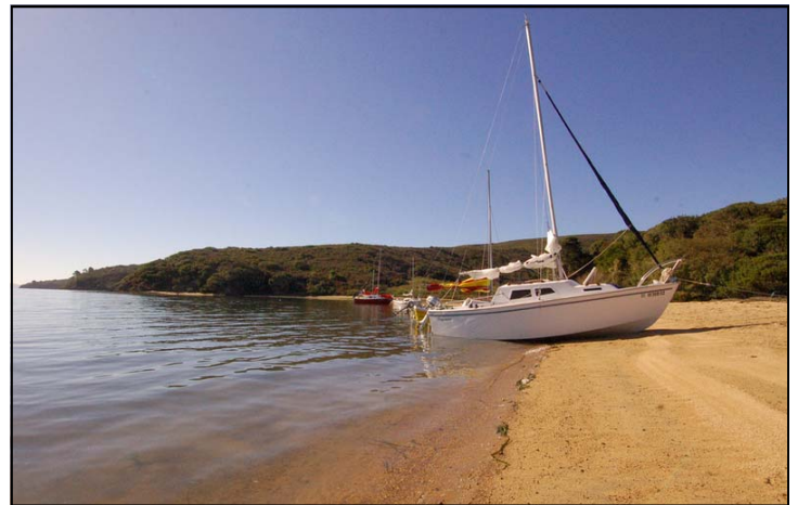
Carl Sundholm and Dagmar, Tomalas Bay

http://www.sailingbreezes.com/Sailing_Breezes_Current/Articles/Oct07/Swanson-NWPassage.htm